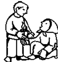
Give drink to the thirsty