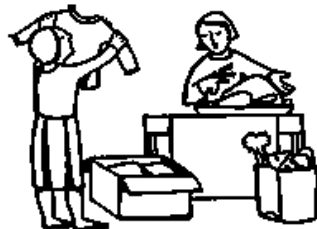
Clothe the naked