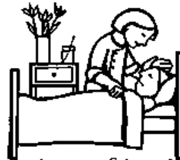
Take care of the sick