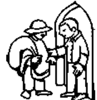
Welcome the Stranger