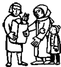
feed the hungry

Must be given to Church and State (Civil Registrar of Marriage)