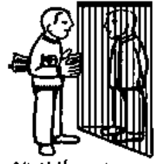
Visit the prisoner

Whatever you do for one of the least of these brothers and sisters of mine, you do for me. (Matt: 25)